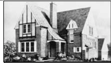
Elmhurst Model Sears Home