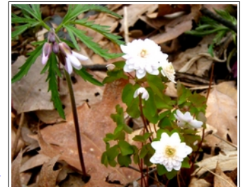
Toothwort & Rue Anemone