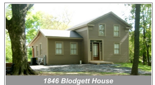
1846 Blodgett House